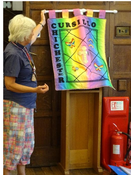
Blessing the new banner